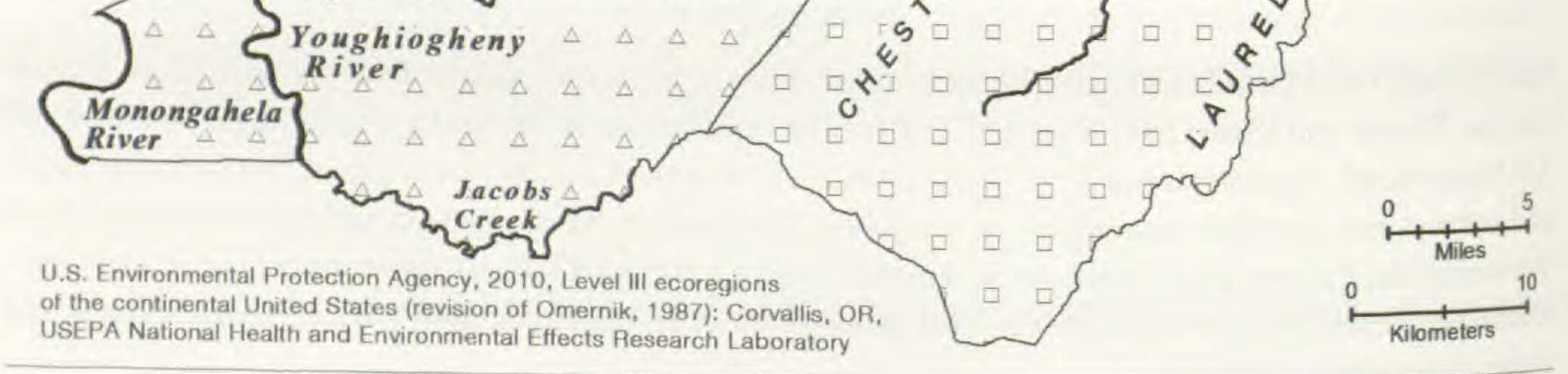
Fig. 1. Small map displays counties in Pennsylvania. Larger map displays major rivers, streams and terrestrial ecoregions in Westmoreland County.

Westmoreland County is comprised of two Level III Terrestrial Ecoregions, categorized according to location, climate, vegetation, hydrology, terrain, wildlife and land use/human activities. This concept of ecological classification, defined and described by the Commission for Environmental Cooperation (2011), is an attempt to classify and map ecological regions across the North American continent at multiple scales. The western two-thirds of Westmoreland County is part of the Western Allegheny Plateau Level III Terrestrial Ecoregion, which covers southwest Pennsylvania, southeast Ohio, western West Virginia, and northeastern Kentucky. The climate of the mid-latitude ecoregion is humid continental, characterized by warm to hot summers and cold winters. The natural vegetation was mostly mixed mesophytic forest of chestnut oak, red maple, white oak, black oak, beech, yellow-poplar, sugar maple, ash, basswood, buckeye, and hemlock. The region contains many perennial moderate- and high-gradient streams; natural lakes are lacking, but some teservoirs have been built.